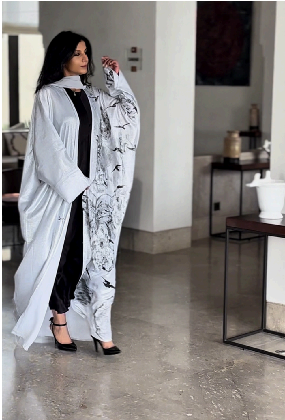
Wings Of Freedom